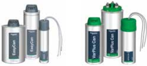
Can (Cylindrical) Type 440V Capacitors