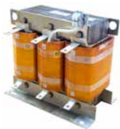
Detuned Reactor 440V Range