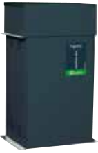
Box (Square) Type 440V Capacitors